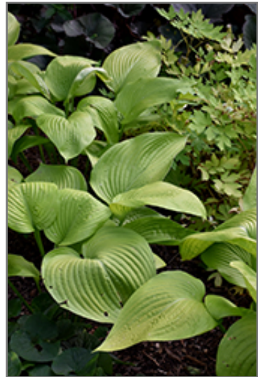
Key West Hosta

This plant does best in partial shade to shade. It prefers to grow in average to moist conditions, and shouldn't be allowed to dry out. It is not particular as to soil type or pH. It is somewhat tolerant of urban pollution. This particular variety is an interspecific hybrid. It can be propagated by division; however, as a cultivated variety, be aware that it may be subject to certain restrictions or prohibitions on propagation.