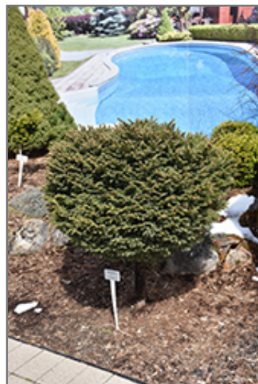
Little Gem Spruce (tree form)