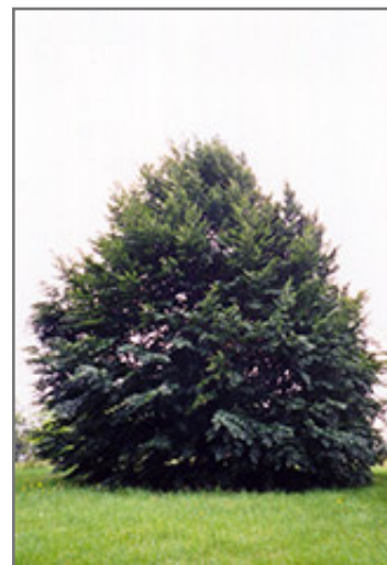
European Beech