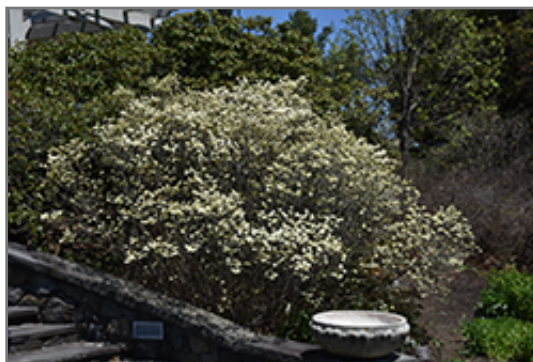
Dwarf Fothergilla in bloom

Dwarf Fothergilla is recommended for the following landscape applications;