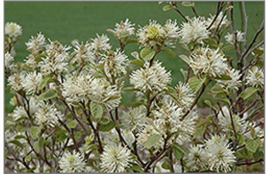
Dwarf Fothergilla flowers

This shrub does best in full sun to partial shade. It requires an evenly moist well-drained soil for optimal growth, but will die in standing water. It is not particular as to soil type, but has a definite preference for acidic soils, and is subject to chlorosis (yellowing) of the foliage in alkaline soils. It is somewhat tolerant of urban pollution. This species is native to parts of North America.