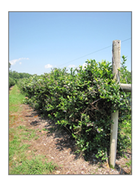
Patriot Blueberry fruit