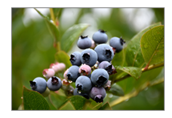
Patriot Blueberry fruit