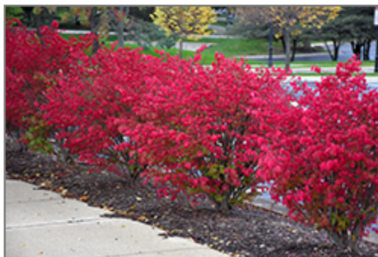
Fire Ball Burning Bush in fall

Fire Ball Burning Bush is recommended for the following landscape applications;