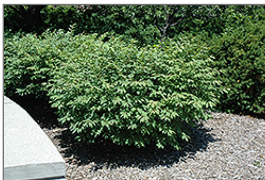
Fire Ball Burning Bush