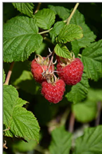
Raspberry Shortcake Raspberry fruit

Raspberry Shortcake Raspberry has rich green deciduous foliage on a plant with an upright spreading habit of growth. The textured oval compound leaves do not develop any appreciable fall color. It features an abundance of magnificent red berries in mid summer.