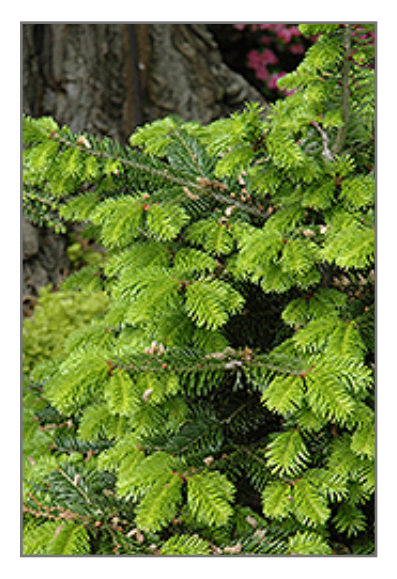
Nordmann Fir foliage