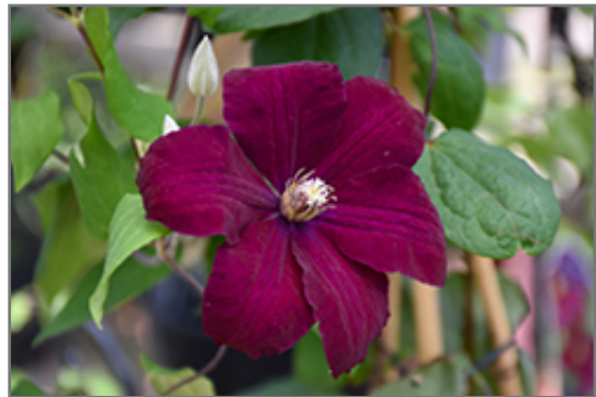
Rouge Cardinal Clematis flowers