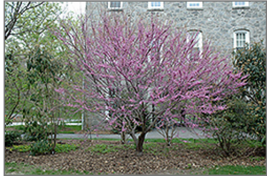
Ace Of Hearts Redbud in bloom

Ace Of Hearts Redbud is recommended for the following landscape applications;