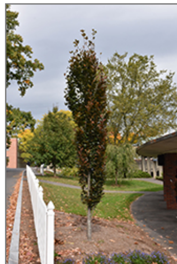
Dawyck Purple Beech