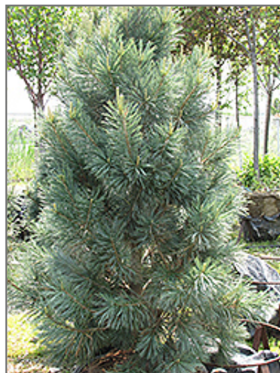
Vanderwolf's Pyramid Pine