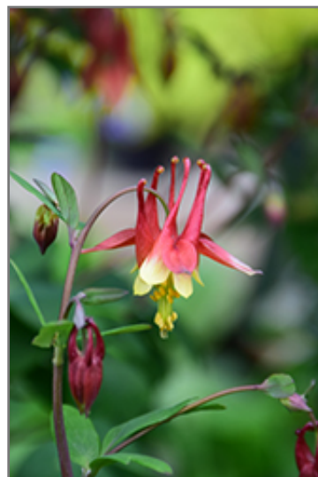
Wild Red Columbine flowers

Wild Red Columbine is recommended for the following landscape applications;