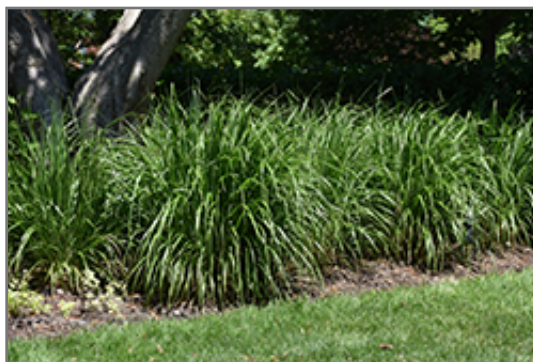
Korean Reed Grass

Korean Reed Grass is recommended for the following landscape applications;