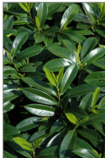
Mount Vernon Laurel foliage