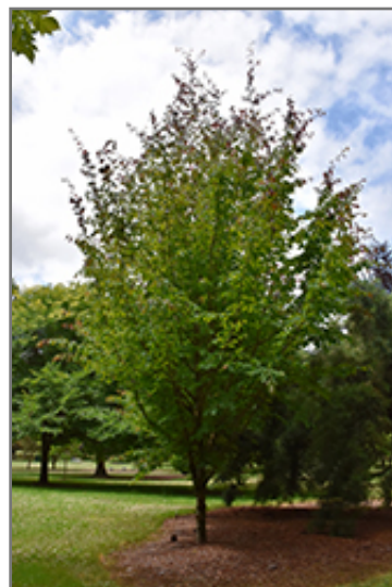
Ruby Vase Parrotia