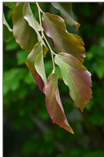
Ruby Vase Parrotia foliage