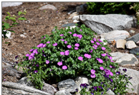
Bloody Cranesbill in bloom