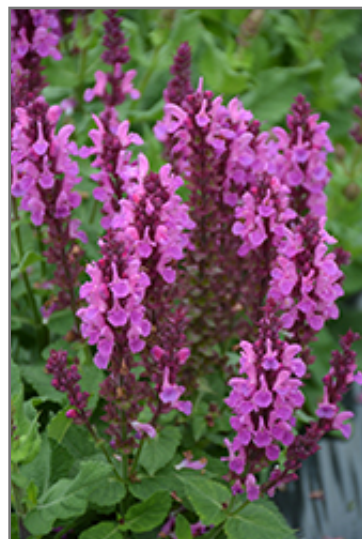
Rose Marvel Meadow Sage flowers

Rose Marvel Meadow Sage is recommended for the following landscape applications;