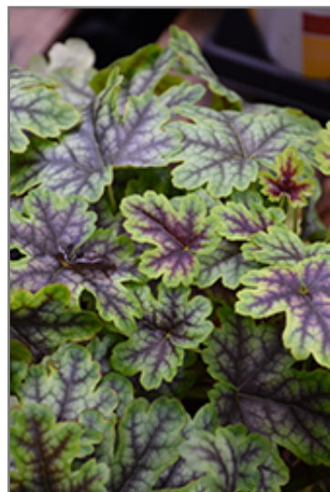
Tapestry Foamy Bells foliage

Tapestry Foamy Bells is recommended for the following landscape applications;