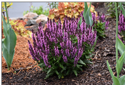
Bumbleberry Meadow Sage in bloom

Bumbleberry Meadow Sage is an herbaceous perennial with an upright spreading habit of growth. Its relatively fine texture sets it apart from other garden plants with less refined foliage.