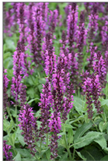
Bumbleberry Meadow Sage flowers