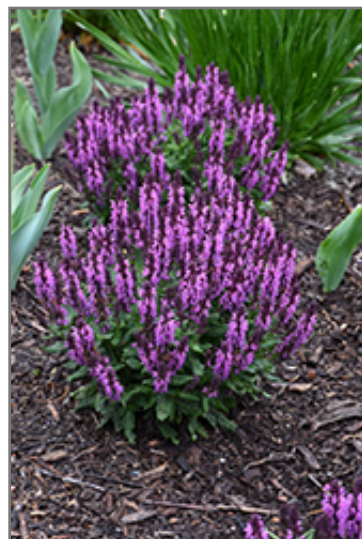
Bumbleberry Meadow Sage in bloom

Bumbleberry Meadow Sage is a fine choice for the garden, but it is also a good selection for planting in outdoor pots and containers. It is often used as a 'filler' in the 'spiller-thriller-filler' container combination, providing a mass of flowers against which the larger thriller plants stand out. Note that when growing plants in outdoor containers and baskets, they may require more frequent waterings than they would in the yard or garden.