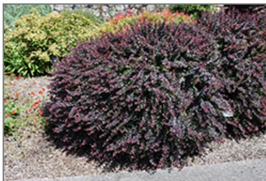
Royal Burgundy Japanese Barberry