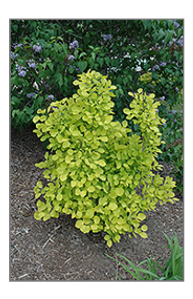
Golden Spirit Smokebush

Golden Spirit Smokebush is recommended for the following landscape applications;