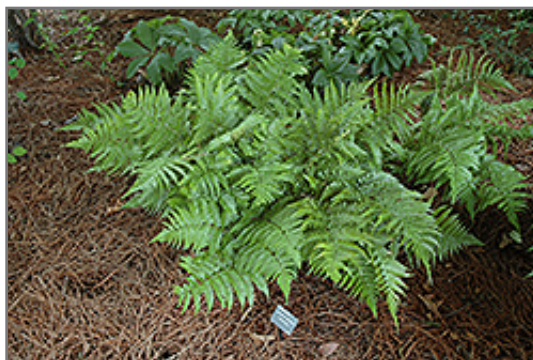
Autumn Fern

Autumn Fern is a fine choice for the garden, but it is also a good selection for planting in outdoor pots and containers. Because of its spreading habit of growth, it is ideally suited for use as a 'spiller' in the 'spiller-thriller-filler' container combination; plant it near the edges where it can spill gracefully over the pot. Note that when growing plants in outdoor containers and baskets, they may require more frequent waterings than they would in the yard or garden.