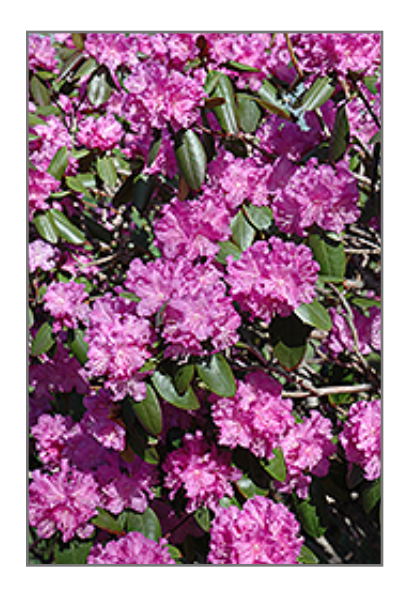
P.J.M. Rhododendron flowers