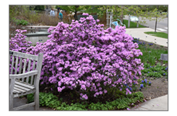
P.J.M. Rhododendron in bloom

P.J.M. Rhododendron is recommended for the following landscape applications;