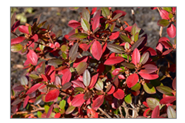
P.J.M. Rhododendron in fall

This shrub does best in full sun to partial shade. You may want to keep it away from hot, dry locations that receive direct afternoon sun or which get reflected sunlight, such as against the south side of a white wall. It requires an evenly moist well-drained soil for optimal growth, but will die in standing water. It is very fussy about its soil conditions and must have rich, acidic soils to ensure success, and is subject to chlorosis (yellowing) of the foliage in alkaline soils. It is somewhat tolerant of urban pollution, and will benefit from being planted in a relatively sheltered location. Consider applying a thick mulch around the root zone in winter to protect it in exposed locations or colder microclimates. This particular variety is an interspecific hybrid.