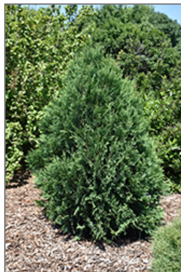
Technito Arborvitae