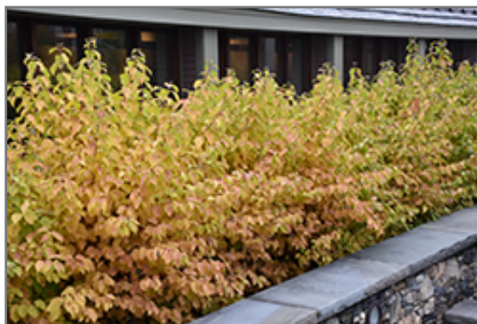
Midwinter Fire Dogwood in fall