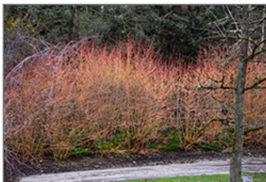
Midwinter Fire Dogwood in winter