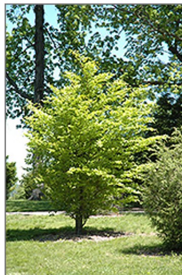
Golden Beech