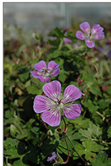
Sweet Heidi Cranesbill flowers