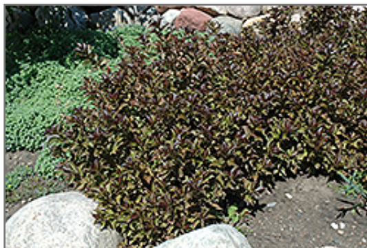
Dark Horse Weigela