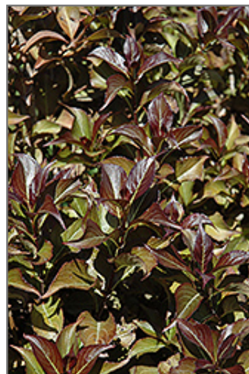
Dark Horse Weigela foliage

Dark Horse Weigela makes a fine choice for the outdoor landscape, but it is also well-suited for use in outdoor pots and containers. Because of its height, it is often used as a 'thriller' in the 'spiller-thriller-filler' container combination; plant it near the center of the pot, surrounded by smaller plants and those that spill over the edges. It is even sizeable enough that it can be grown alone in a suitable container. Note that when grown in a container, it may not perform exactly as indicated on the tag - this is to be expected. Also note that when growing plants in outdoor containers and baskets, they may require more frequent waterings than they would in the yard or garden.