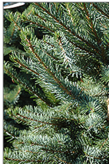
Bruns Spruce foliage