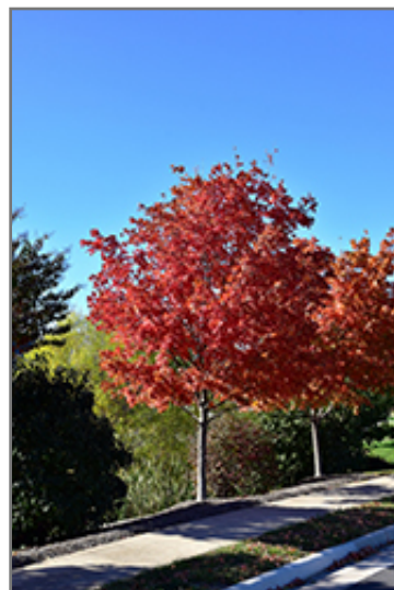
Crescendo Sugar Maple in fall