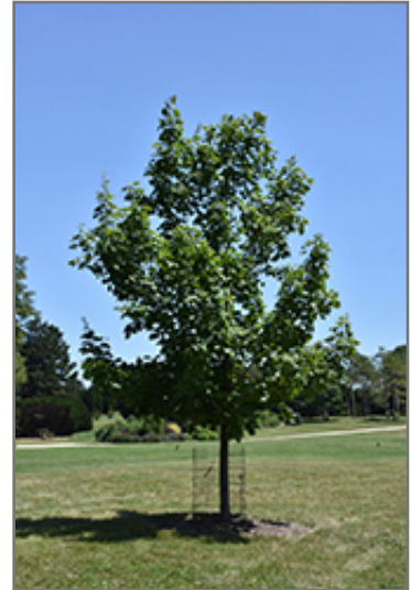
Crescendo Sugar Maple

This tree should only be grown in full sunlight. It is very adaptable to both dry and moist locations, and should do just fine under average home landscape conditions. It is not particular as to soil pH, but grows best in rich soils. It is somewhat tolerant of urban pollution. This is a selection of a native North American species.