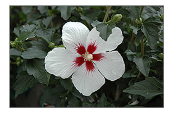
Lil' Kim Rose of Sharon flowers

Lil' Kim Rose of Sharon is recommended for the following landscape applications;