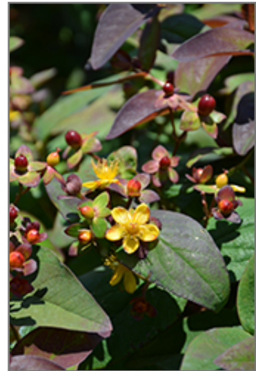
Albury Purple St. John's Wort flowers