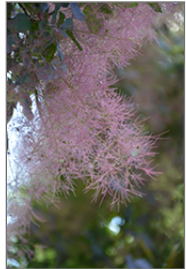
Royal Purple Smokebush flowers

This shrub should only be grown in full sunlight. It is very adaptable to both dry and moist locations, and should do just fine under average home landscape conditions. It is not particular as to soil type or pH. It is highly tolerant of urban pollution and will even thrive in inner city environments, and will benefit from being planted in a relatively sheltered location. This is a selected variety of a species not originally from North America.