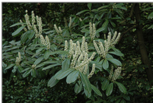
Cherry Laurel flowers

Cherry Laurel is recommended for the following landscape applications;