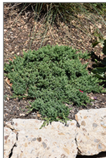
Green Mound Dwarf Japanese Juniper