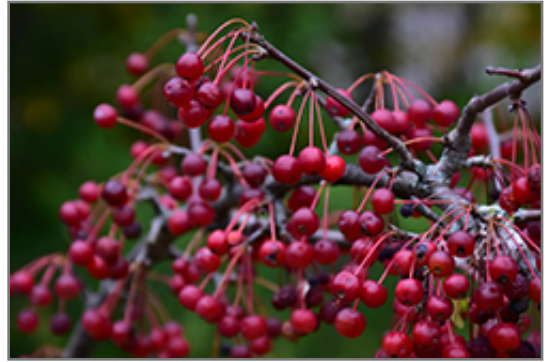
Firebird Flowering Crab fruit

This shrub should only be grown in full sunlight. It prefers to grow in average to moist conditions, and shouldn't be allowed to dry out. It is not particular as to soil type or pH. It is highly tolerant of urban pollution and will even thrive in inner city environments. This is a selected variety of a species not originally from North America.