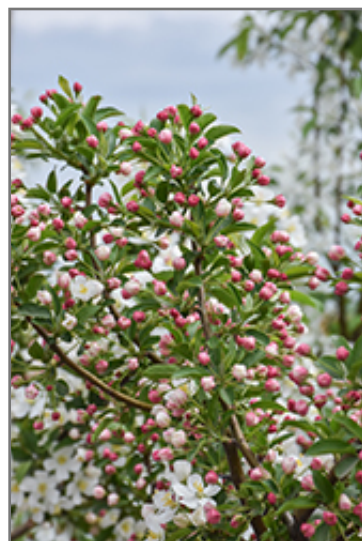
Firebird Flowering Crab flower buds