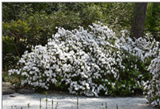
Delaware Valley White Azalea in bloom