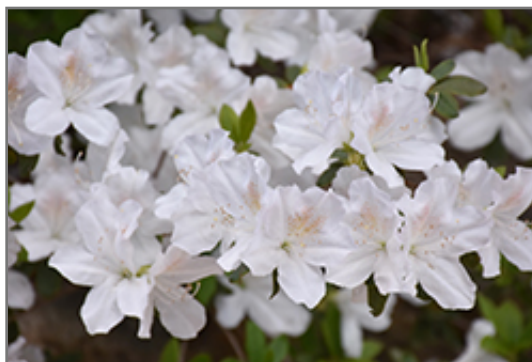
Delaware Valley White Azalea flowers