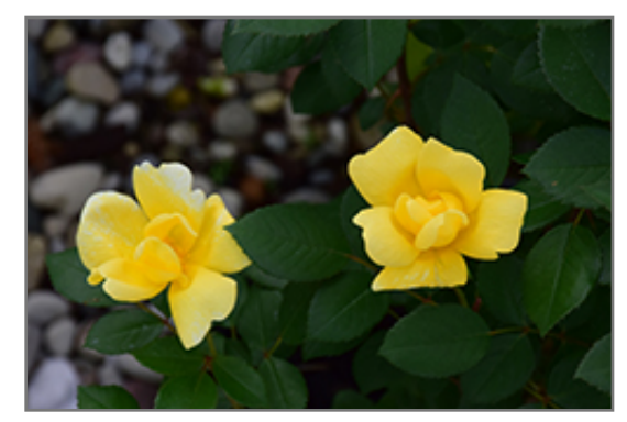
Sunny Knock Out Rose flowers