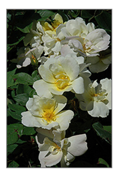
Sunny Knock Out Rose flowers