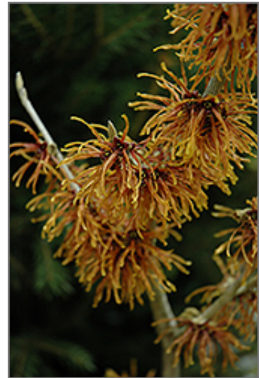
Jelena Witchhazel flowers

Jelena Witchhazel is recommended for the following landscape applications;