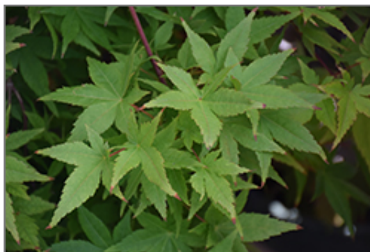
Ryusen Japanese Maple foliage