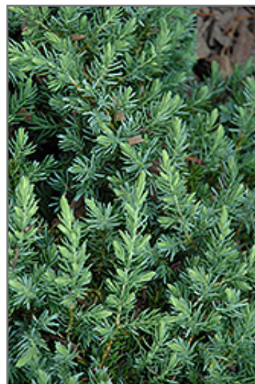
Blue Pacific Shore Juniper foliage