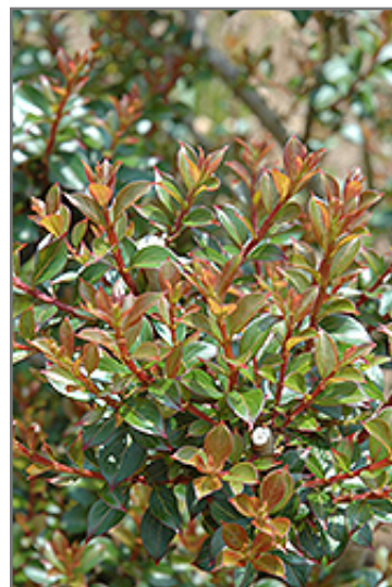
Pocomoke Crapemyrtle foliage

Pocomoke Crapemyrtle makes a fine choice for the outdoor landscape, but it is also well-suited for use in outdoor pots and containers. Because of its height, it is often used as a 'thriller' in the 'spiller-thriller-filler' container combination; plant it near the center of the pot, surrounded by smaller plants and those that spill over the edges. It is even sizeable enough that it can be grown alone in a suitable container. Note that when grown in a container, it may not perform exactly as indicated on the tag - this is to be expected. Also note that when growing plants in outdoor containers and baskets, they may require more frequent waterings than they would in the yard or garden.