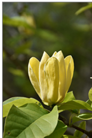
Yellow Bird Magnolia flowers