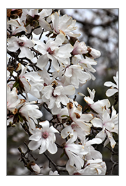
Merrill Magnolia flowers

This tree does best in full sun to partial shade. It requires an evenly moist well-drained soil for optimal growth, but will die in standing water. It is not particular as to soil type, but has a definite preference for acidic soils. It is quite intolerant of urban pollution, therefore inner city or urban streetside plantings are best avoided. Consider applying a thick mulch around the root zone in winter to protect it in exposed locations or colder microclimates. This particular variety is an interspecific hybrid.