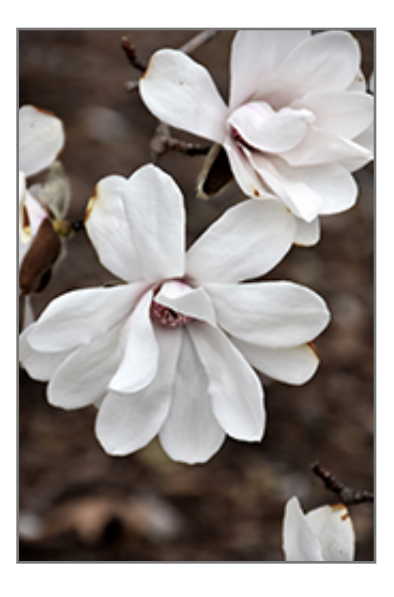
Merrill Magnolia flowers