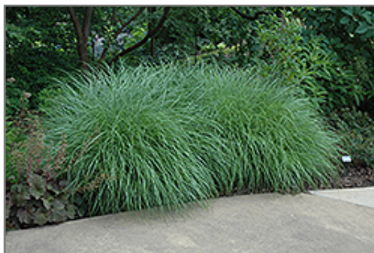
Little Kitten Dwarf Maiden Grass

This plant will require occasional maintenance and upkeep, and is best cleaned up in early spring before it resumes active growth for the season. It is a good choice for attracting birds to your yard, but is not particularly attractive to deer who tend to leave it alone in favor of tastier treats. It has no significant negative characteristics.