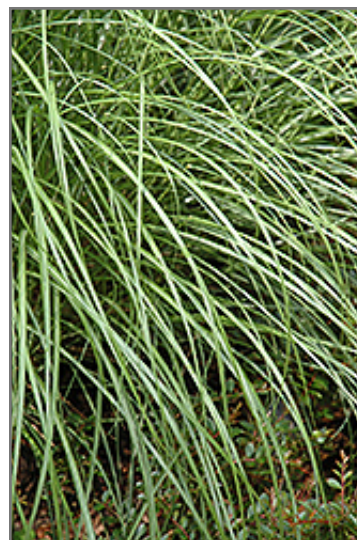
Little Kitten Dwarf Maiden Grass foliage