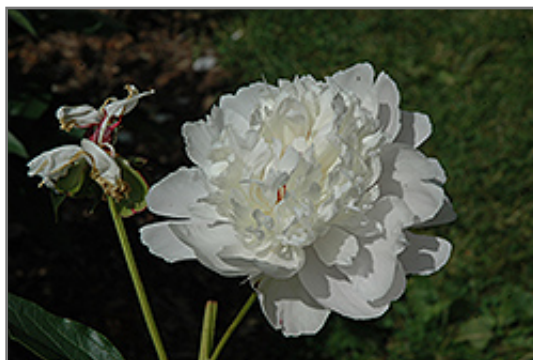
Madame Calot Peony flowers