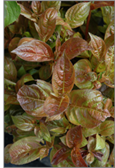
Wings Of Fire Weigela foliage

This shrub should only be grown in full sunlight. It prefers to grow in average to moist conditions, and shouldn't be allowed to dry out. It is not particular as to soil type or pH. It is highly tolerant of urban pollution and will even thrive in inner city environments. This is a selected variety of a species not originally from North America.