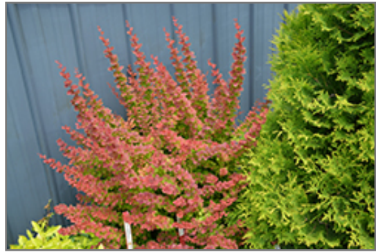
Sunjoy Tangelo Japanese Barberry

Sunjoy Tangelo Japanese Barberry will grow to be about 4 feet tall at maturity, with a spread of 4 feet. It tends to fill out right to the ground and therefore doesn't necessarily require facer plants in front. It grows at a medium rate, and under ideal conditions can be expected to live for approximately 20 years.