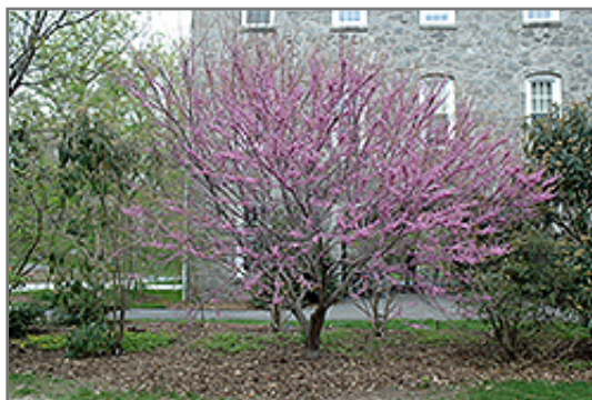
Ace Of Hearts Redbud in bloom

Ace Of Hearts Redbud is recommended for the following landscape applications;